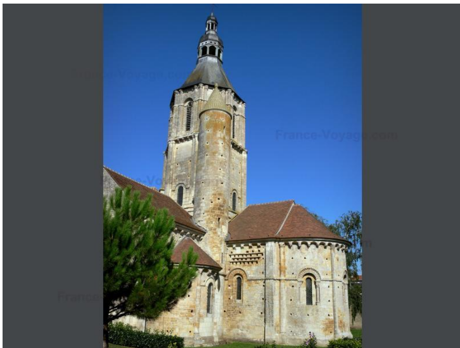
Eglise de Saint Nicholas, Civray (see inside Page 7)